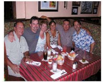
Community Group - LA World Impact Painting Party Celebration!